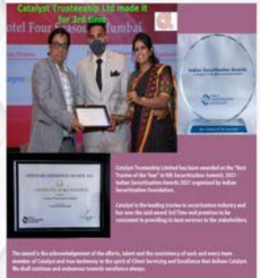
Catalyst Trusteeship Limited has been awarded as the "Best Trustee of the Year" in RR Securitisation Segment, 2021 Indian Securitisation Awards 2021 organised by Indian Securitisation Foundation.