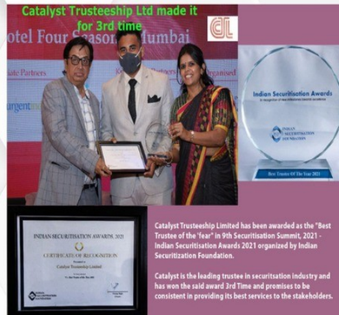
The award is the acknowledgement of the efforts, talent and the consistency of each and every team member of Catalyst and true testimony to the spirit of Client Servicing and Excellence that defines Catalyst. We shall continue and endeavour towards excellence always.