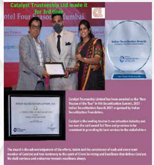
Catalyst Trusteeship Limited has been awarded as the "Best Trustee of the Year" in 9th Securitisation Summit, 2021 - Indian Securitisation Awards 2021 organized by Indian Securitisation Foundation.